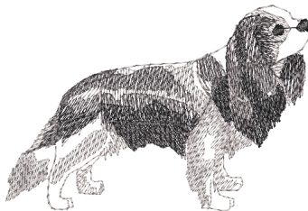
Left Chest Embroidery Approx. Size 4" X 3 1/2" Cavalier Small Standing Sketch #LLE0522