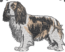
Left Chest Embroidery Not for Hats Approx. Size 4" X 3 1/2" Cavalier King Charles #dcg991