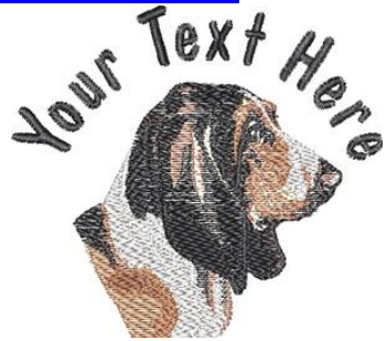
Left Chest Embroidery Approx. Size 4" X 3 1/2" Basset Head #BT2793