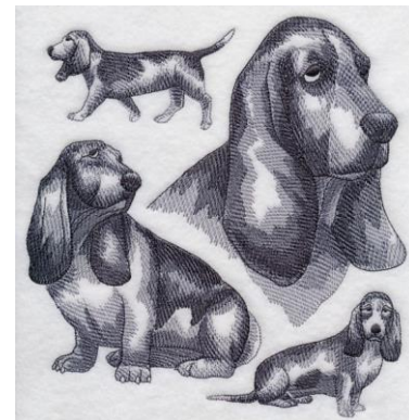
Center Front / Full Back Not for Hats Approx. Size 7 1/2" X 7 3/4" Basset Sketch #H7058