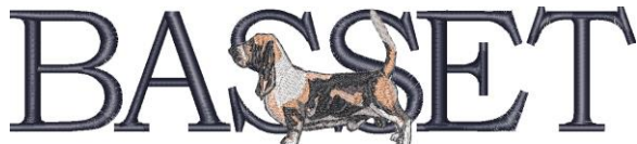
Center Front/Full Back Embroidery Not for T-Shirts & Hats Approx. Size 10 1/2" X 2 1/2" Basset Lettering #LLE0240