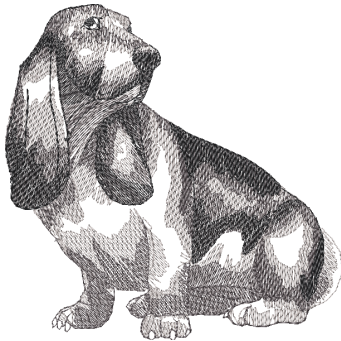
Center Front/Full Back Approx. Size 4 3/4" X 4 3/4" Basset Setting Large Sketch #LLE0244