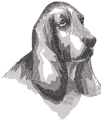
Center Front/Full Back Approx. Size 4 3/4" X 4 3/4" Basset Head Sketch #LLE0245