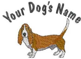
Left Chest Embroidery Approx. Size 4" X 3 1/2" Basset Profile #DG0127